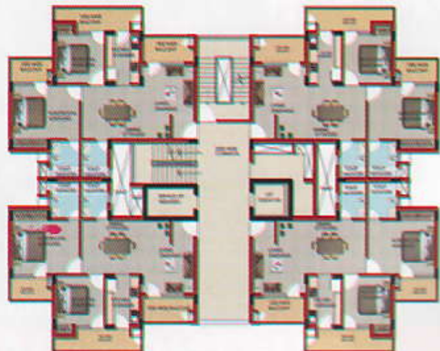
Typical Floor Plan (1st-8th Floor) Type-C

(This plans/images are Indicative and for artistic impression)